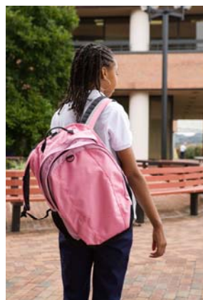
WRONG Strap on one shoulder