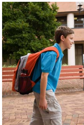
WRONG Load too heavy