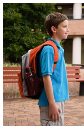
CORRECT Load no more than 10-15% of body weight